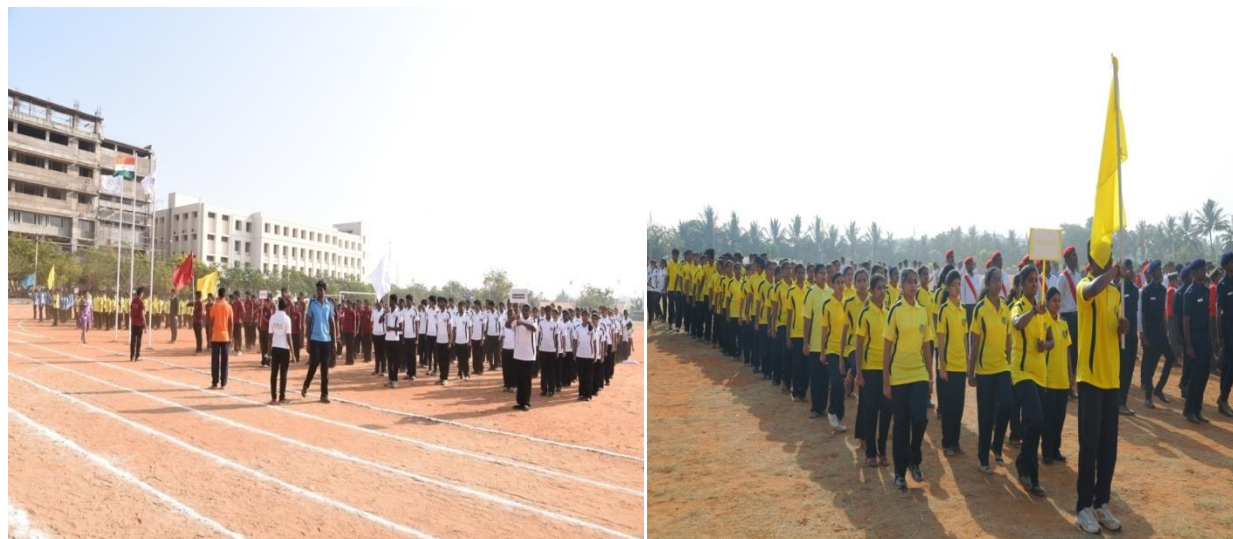
Students March-past during Inauguration of Sports day