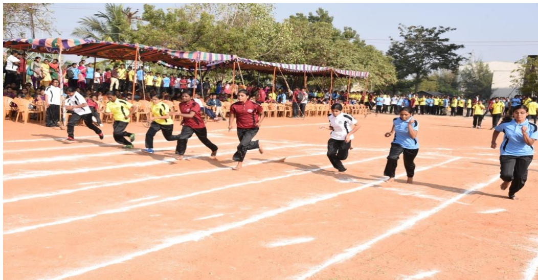
Sports Day Event – 100 mts Women