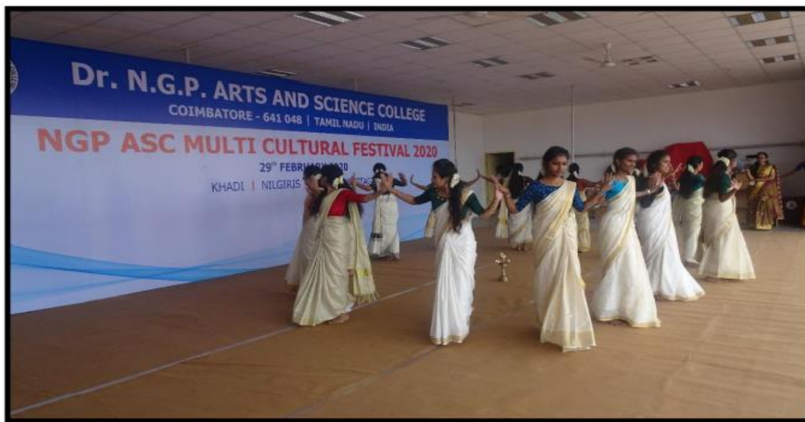
Students performing group dance in Kerala Heritage at Dr. NGPASC Multicultural festival 2020