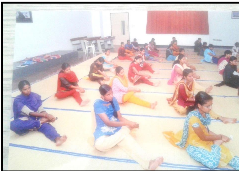
International Yoga Day celebrations