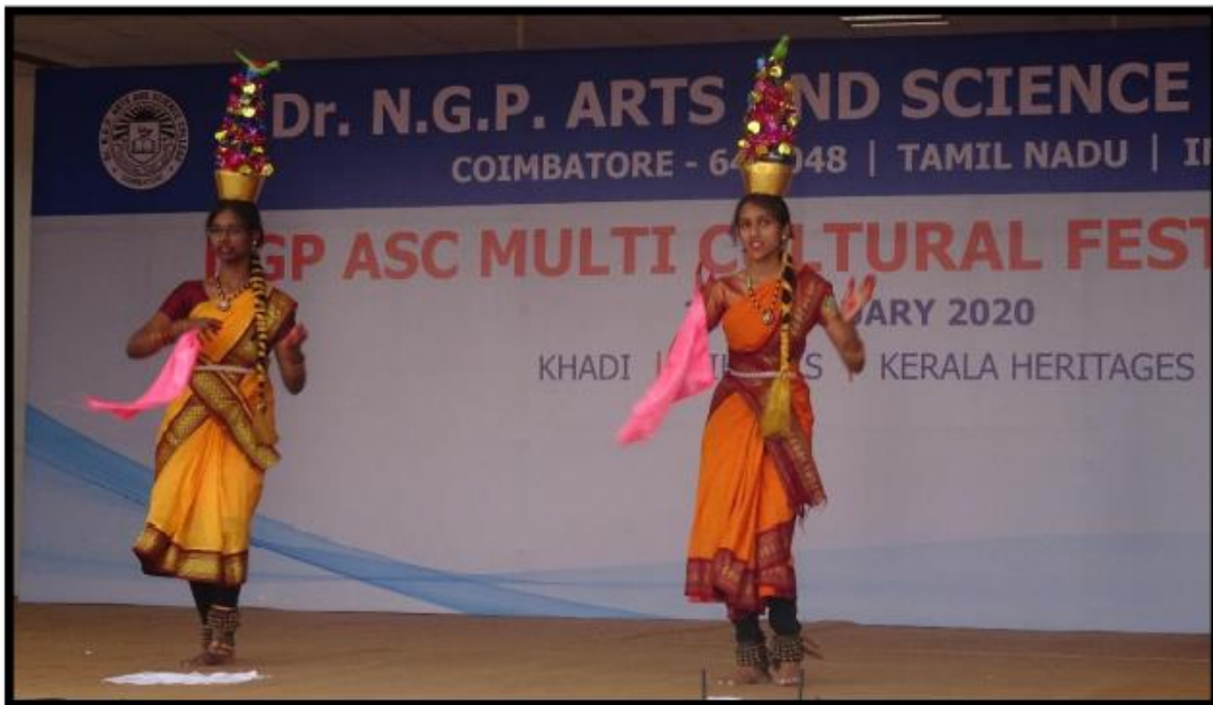
Students performing Karagam in Khadi category at Dr.NGPASC Multicultural festival 2020