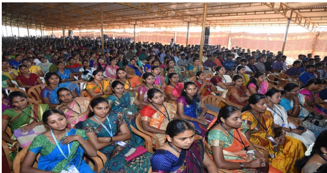
Our members of staff and students enjoying students' performance in NGP FEST 2016 – Intra departmental cultural fest on December 23, 2016 at Paavai Arangam.