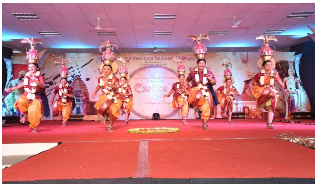
Students performing classical Karagam group dance in EXOTICA 2017 – South Zone Inter Collegiate cultural fest on February 10,2017 at Paavai Arangam.