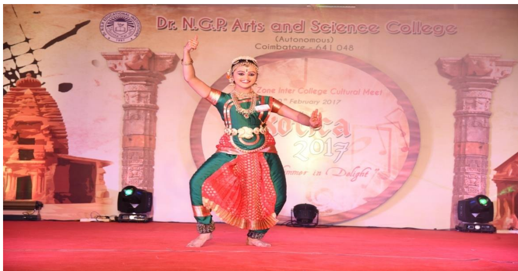
Student performing classical solo dance in EXOTICA 2017 – South Zone Inter Collegiate cultural fest on February 10,2017 at Paavai Arangam.