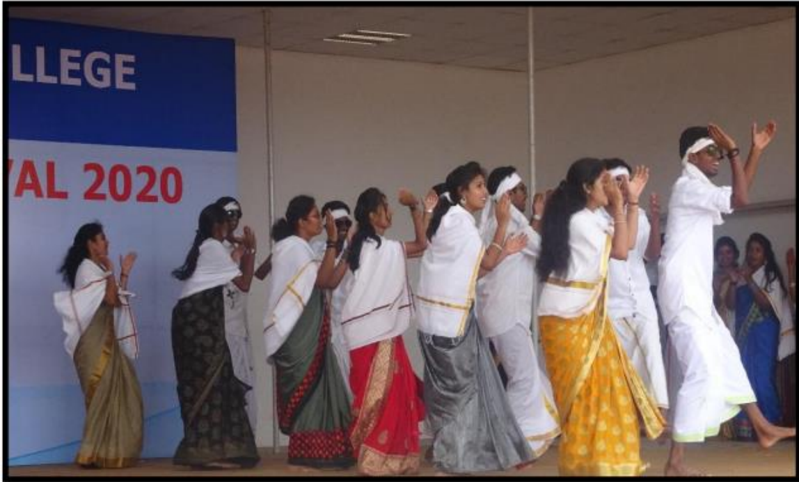
Students performing Traditional Badaga dance in Niligiri Heritage