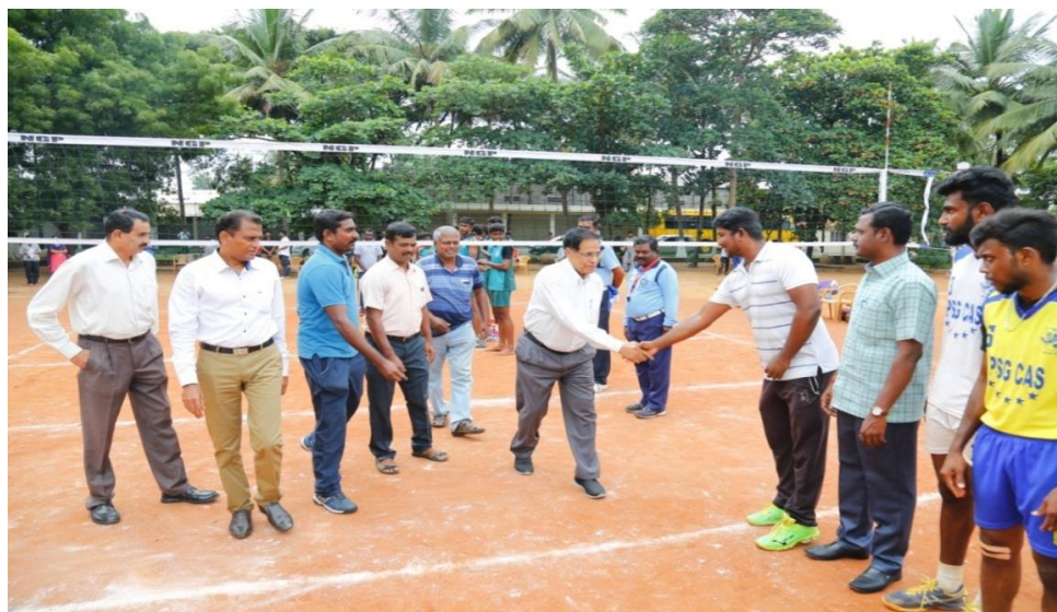
Inauguration of Bharathiar University Inter Zone Volleyball Tournament for Men was held in Dr.N.G.P. Arts and Science College on 21.10.2019 and 22.10.2019.