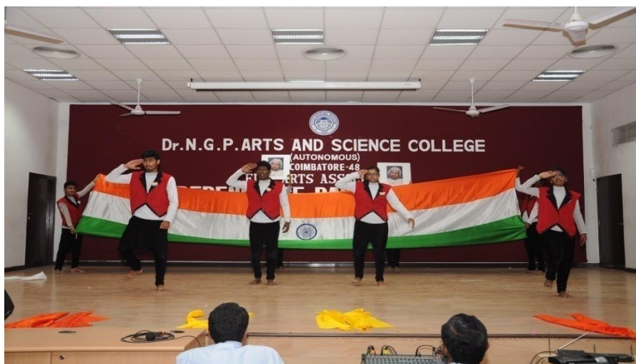
First year UG Students performing devoted group dance in Independence Day Celebrations on August 15, 2017 at NGP Conference Centre.

Sample Photos for cultural, sports and yoga activities