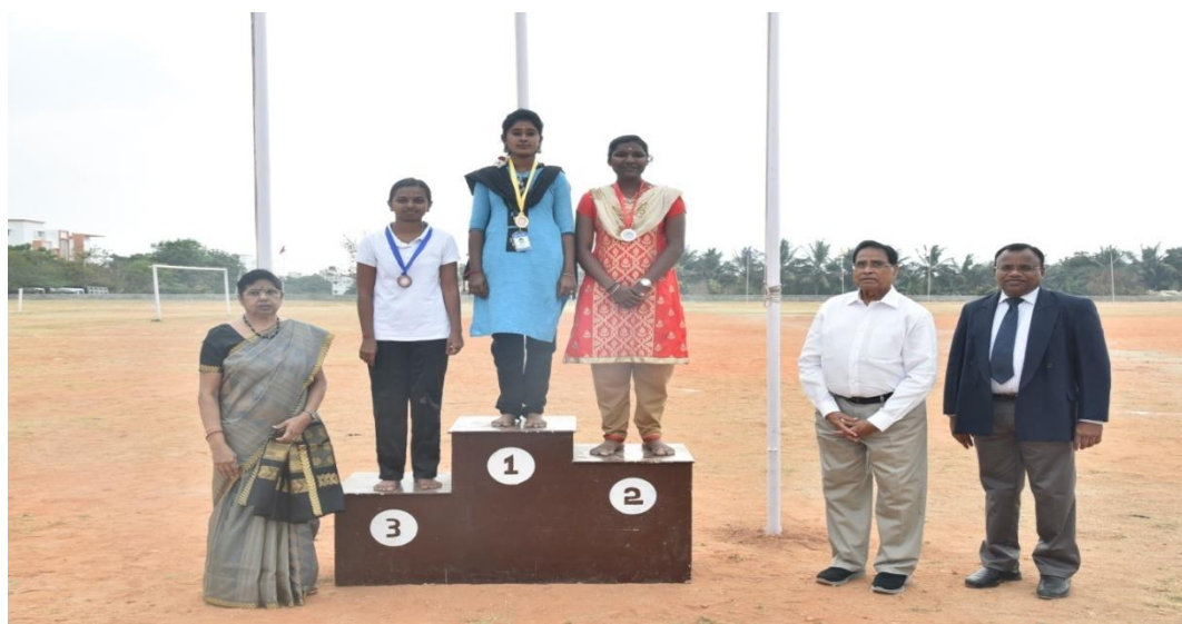
Sports Day Event- Prize distributions to Achievers in Paavai Arankam