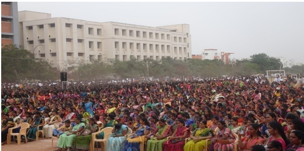
Students crowd enjoying in NGPASC Multicultural Fest - Khadhi, Nilgiris and Kerala Heritages on February 29, 2020 at Paavai Arangam.