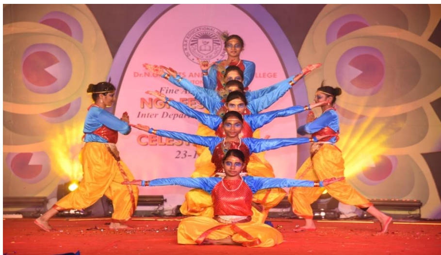
Students performing Traditional group dance in NGP FET 2018 – Intra departmental cultural fest on December 19, 2018 at Paavai Arangam.